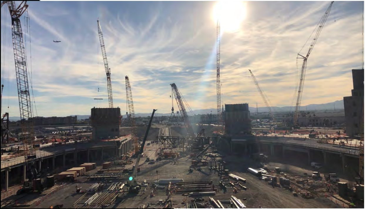
Above: View from 200 level, looking South.