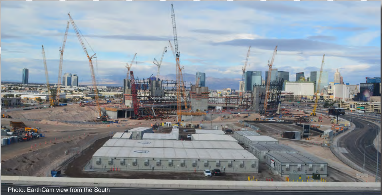
view from the South