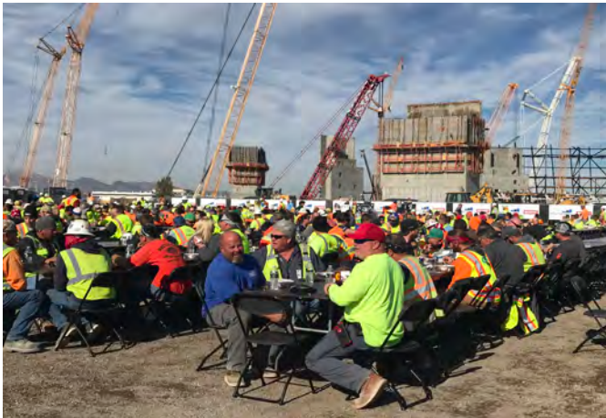
Workers enjoy lunch and a visit from Raiders Owner Mark Davis at the 4th Quarter Worker Appreciation Lunch.