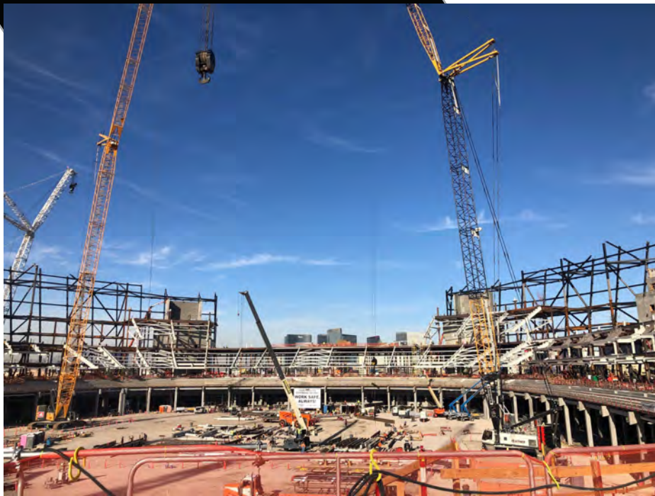
Below: View from the 100 level, looking North.

All photographs appearing in this document are the property of LV Stadium Events Company, LLC. They are protected by U.S. Copyright Laws, and are not to be shared or reproduced in any way without the written permission of LV Stadium Events Company, LLC. Copyright 2018 LV Stadium Events Company, LLC. All Rights Reserved.