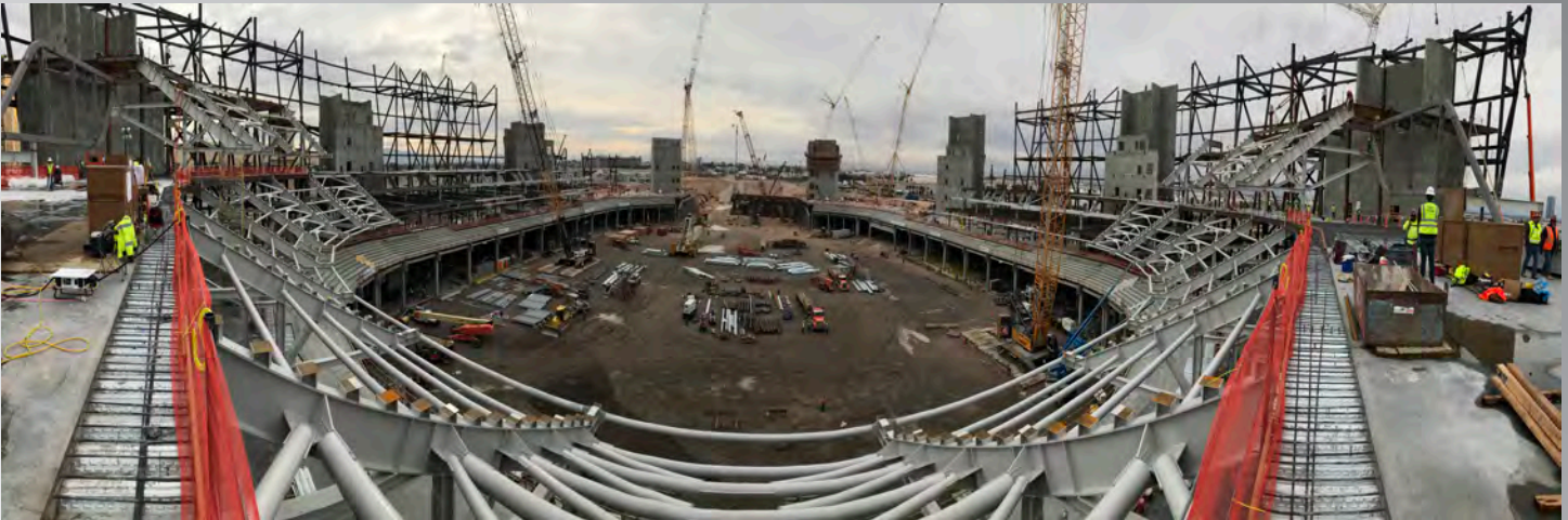
Bowl Panorama looking South from the 200 level.

Mortenson | McCarthy has implemented LCPTracker Construction Certified Payroll – Labor Compliance Software which is a widely recognized tracking and certification software for prevailing wage projects. Mortenson | McCarthy maintains and updates the required prevailing wage rates in the database, based on those published by the Nevada Labor Commissioner's website. All contractors that have received a construction contract and are subject to the prevailing wage requirements are required to report payroll hours and wages for designated workers through this system. The contractor's entries into this system verifies compliance with wages and fringes as noted in the NRS 338 requirements.