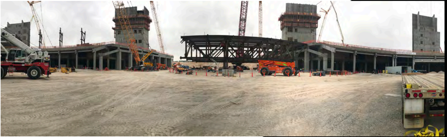
Above: Panoramic view of long span field truss erection. Below: Preparations for the erection of the first long span field truss.