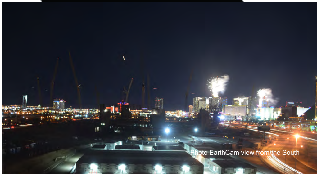
View of the Strip Fireworks on New Year's Eve.

First Quarter 2019 (TBD) - Package X.2 –Main Ticket Office Building 7 Ticket Canopies